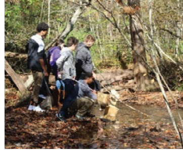
Campers investigate an aquatic ecosystem, collect macroinvertebrates, and determine the health of Holliday Lake and the surrounding creeks during an aquatic ecology class.